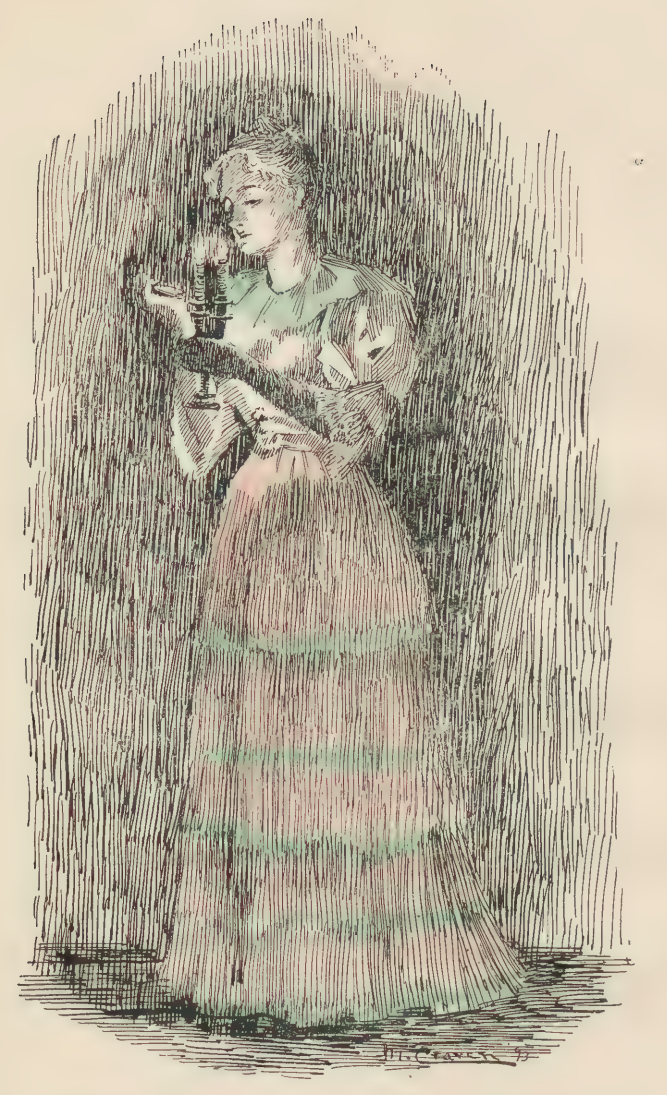
AND OPENED THE CASE OF A MINIATURE, SLOWLY AND WITH DELIBERATE CARE.